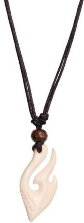
Item : HM-6