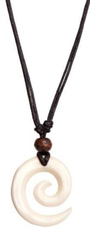
Item : K-3