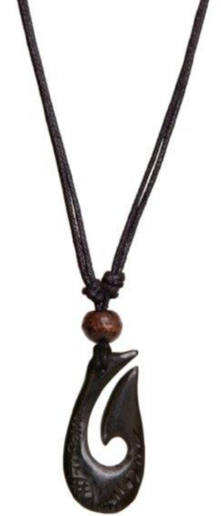
Item : HM-8