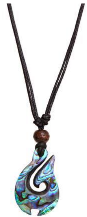
Item : HM-4