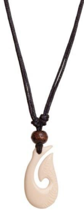
Item : HM-9