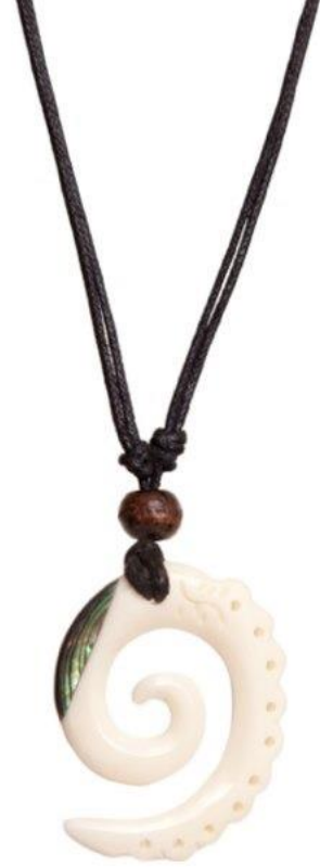
Item : K-2