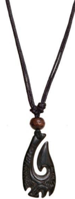
Item : HM-3