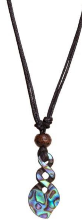
Item : T-2