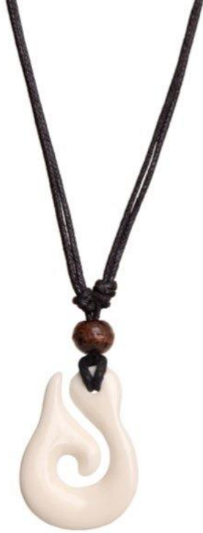
Item : HM-2