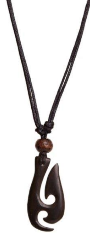
Item : HM-7