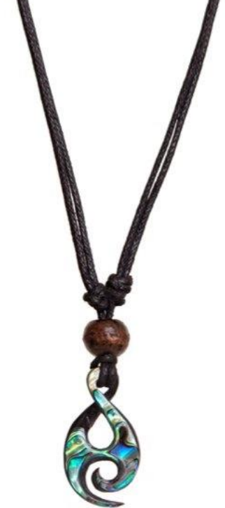
Item : T-3