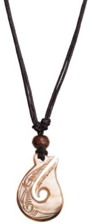
Item : HM-5