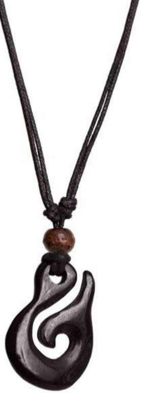
Item : HM-1